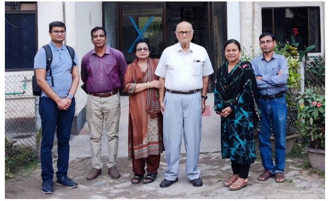
Our supporter (left), his parents, and some LAMB staff