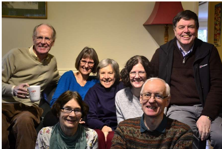
LAMB Health Trustees